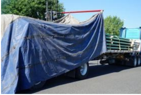
Truck Tarping System by Hy-Safe